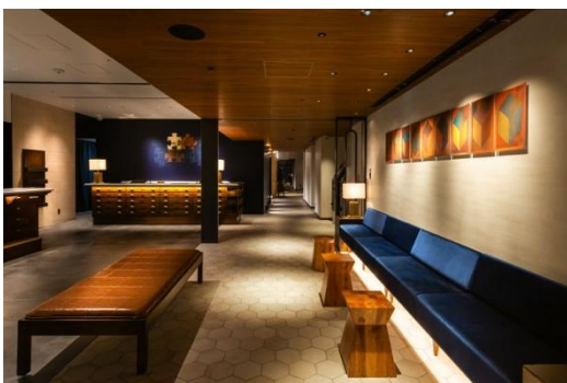
1F ENTRANCE LOBBY

Using off-the-shelf items, creates art that embody human perception and engineering systems. Expression methods are diverse, including acoustic works, objects, images, interactive works and installations.